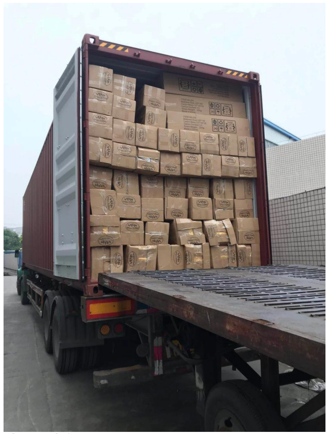
What can I do for you