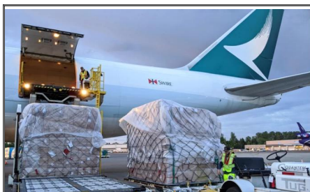
Air Freight from China to Australia

SWWLS air-shipment offer reliable and flexible air freight options, whether airport-to-airport, door-to-door, or any combination. Our carriers are carefully selected to ensure the safe delivery of your goods from China to Canada.