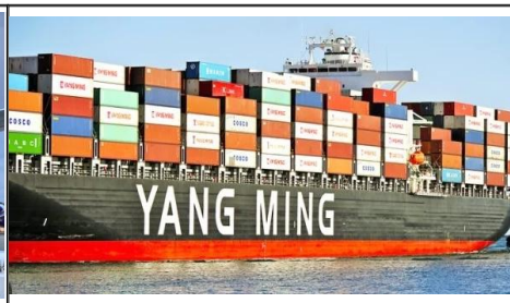
Sea Freight from China to Canada Affordable Port-to-Port and Door-to-Door sea freight services from China to Canadian destinations such as Vancouver, Montreal, Toronto, and more. Enjoy fast delivery within 25-35 days and receive tailored solutions.