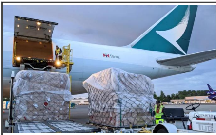
Air Freight from China to Canada SWWLS air-shipment offer reliable and flexible air freight options, whether airport-to-airport, door-to-door, or any combination. Our carriers are carefully selected to ensure the safe delivery of your goods from China to Canada.