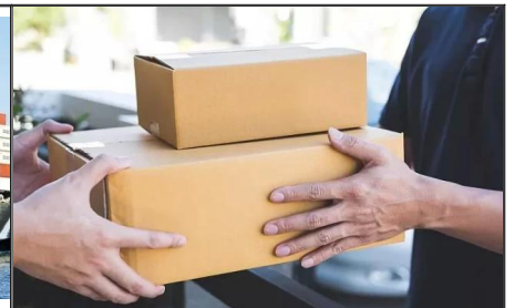
Door to Door shipping China to Canada Door to Door Air freight and Sea freight to Canada, efficient and safe deliveries from China to Canada with import customs clearance and duties service at a competitive price, free pick up from your China manufacturers.